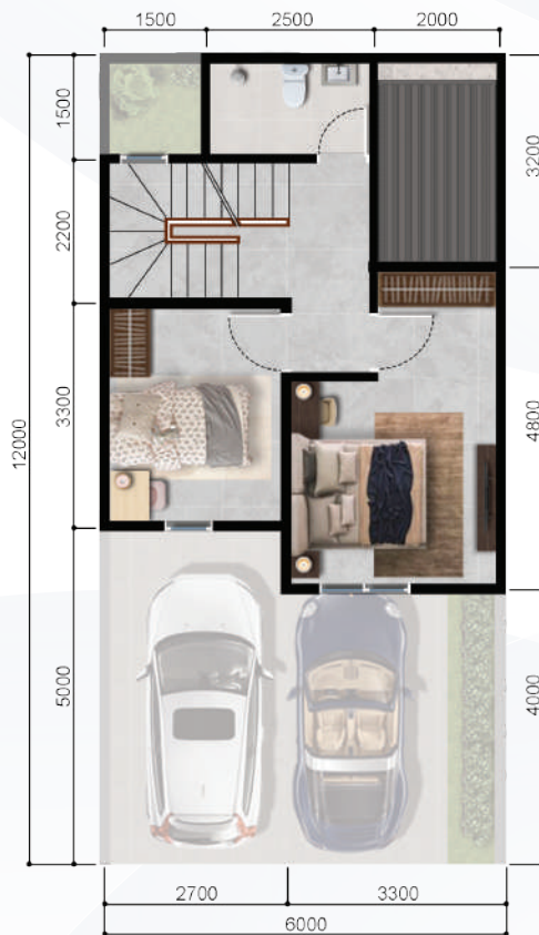
2 nd Floor Plan