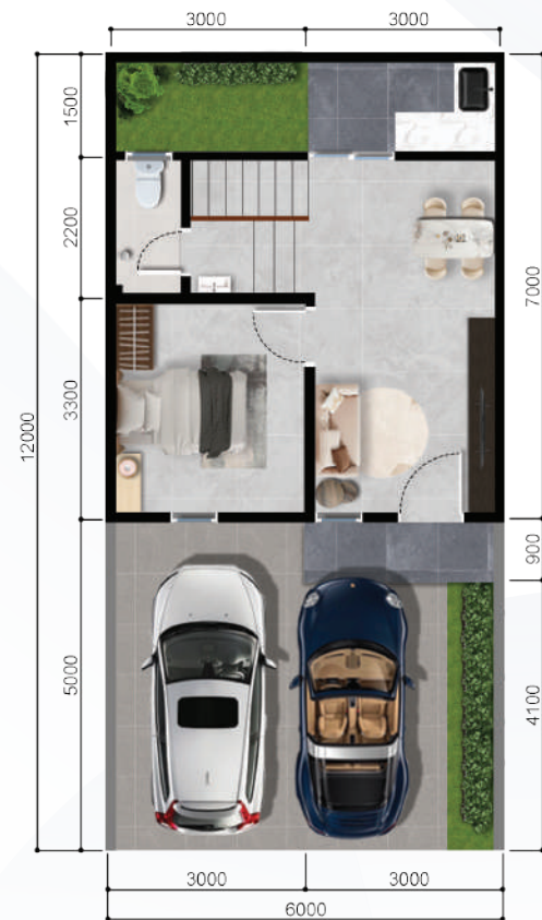
1 st Floor Plan